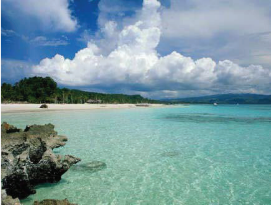
An example using ISB Colors