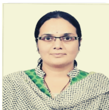
Lakshmi Kalam Rishi Engineering College (for women)