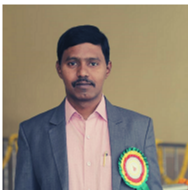
Surendra Naidu Ananthalakshmi Institute of Technology and Sciences