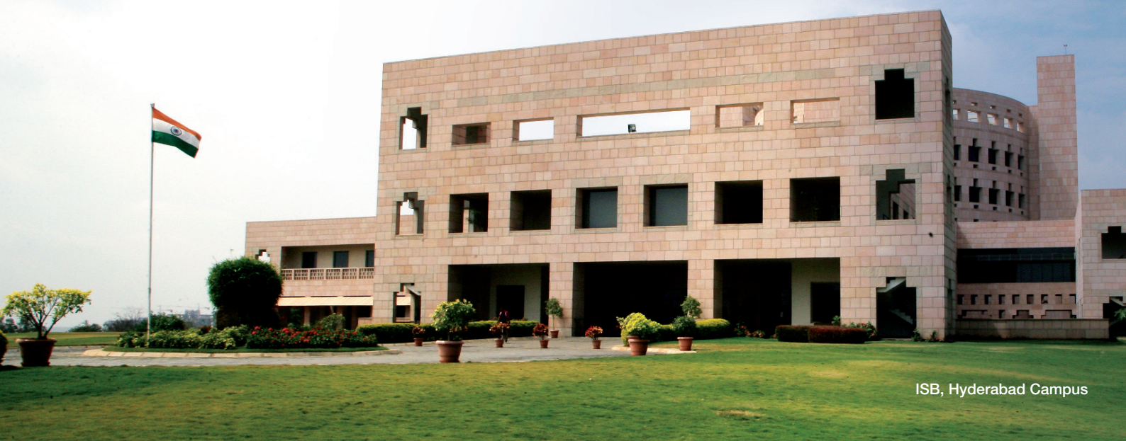
ISB, Hyderabad Campus